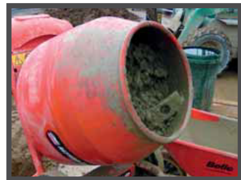
RAPID MIX DRUM PADDLES