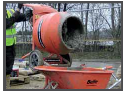
BARROW HEIGHT TIPPING