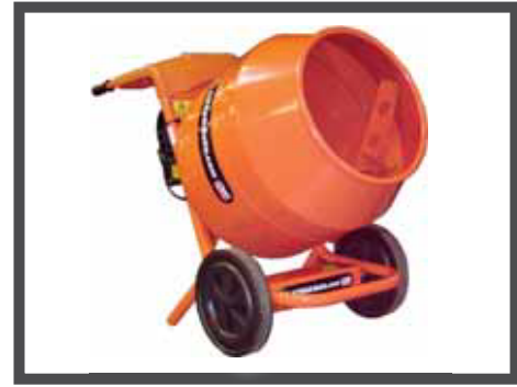
ON OR OFF STAND OPERATION